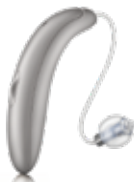
Moxi V-RS +

is our rechargeable RIC with telecoil and direct connectivity (charging case included)