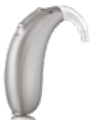
Stride V-SP +

is our rechargeable BTE with direct connectivity (charging case included)