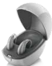
Charging case for Stride V-PR