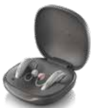
Charging case for Moxi V-RS