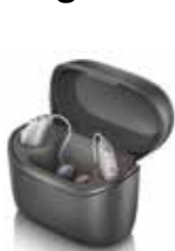
Charging case for Moxi V-R and Moxi V-RT