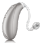
Stride™ V-M +

is our smallest BTE with a standard battery, telecoil and direct connectivity