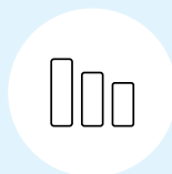
Log It All