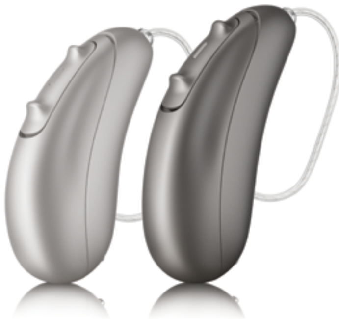
Moxi Vivante R